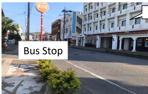
Hotel Delfino Nago

※ 1 The bus stop is two-minute walk from the Super Hotel. The name of the stop is "為又-Biimata".