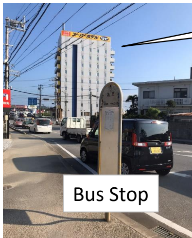
Super Hotel Nago